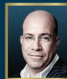
JEFF ZUCKER CHAIRMAN, WARNERMEDIA NEWS AND SPORTS; PRESIDENT, CNN WORLDWIDE