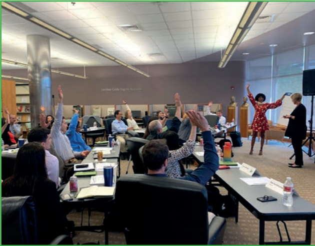
IA Class 6 participants gather in the Barco Library during their IA Kickoff at The Cable Center

Our Ambassadors Council gathers Cable Center champions from all over the industry, from content providers and MSOs to associations. Through social media, interaction and programme attendance, the Ambassadors Council helps to support The Cable Center and drive its mission of connecting people and ideas to advance innovation. The Ambassadors meet monthly to stay up-to-date on our programmes, events, opportunities and resources. This year, we are growing our Ambassadors Council to include an LA contingent, and there are plans to expand to Atlanta and New York.