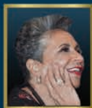
CATHY HUGHES FOUNDER & CHAIRWOMAN, URBAN ONE