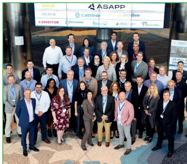
The C5 programme gathers at The Cable Center for one of its quarterly conferences